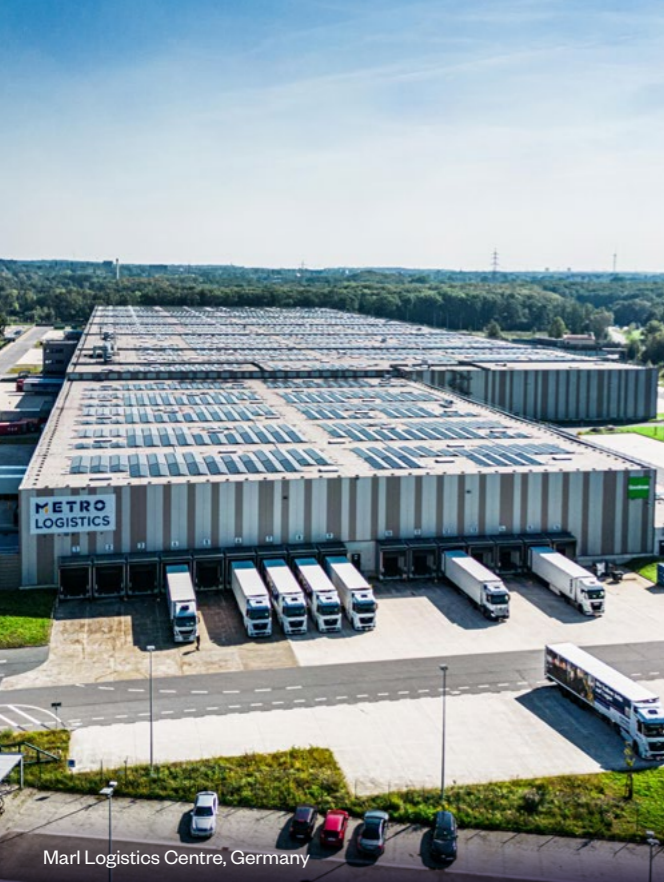
Mar1 Logistics Centre, Germany